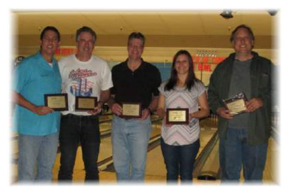
2nd PLACE Mackay & Somps Score 3566