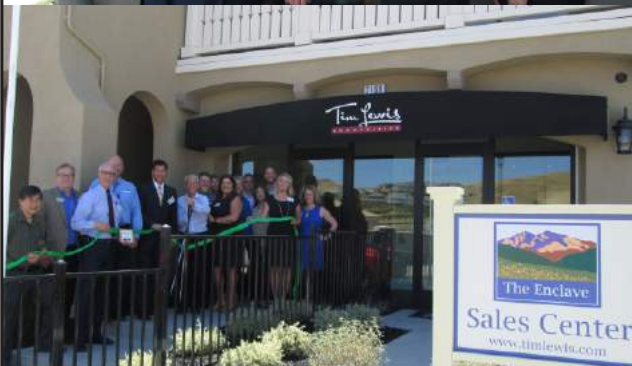
Grand Opening & Ribbon Cutting Ceremony | July 6, 2017