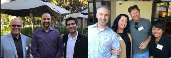
April Networking Mixer | April 27, 2017