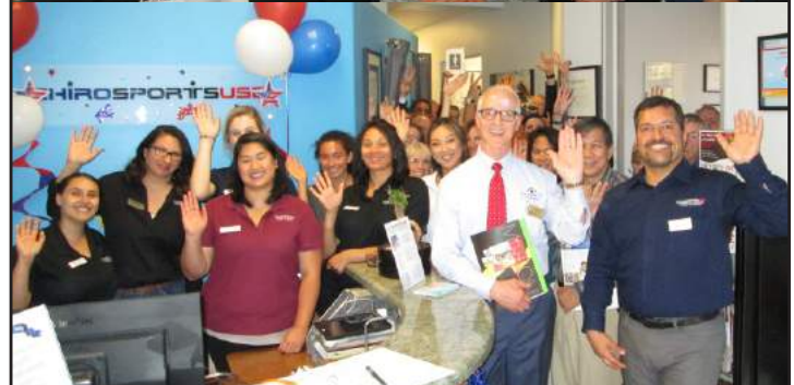
June Networking Mixer | June 29, 2017

CHIROSPO RTSUSA CHIROPRACTIC • MASSAGE • FITNESS • NUTRITION