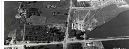
1961 Aerial view of Dublin